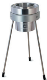
Flow cup stand

Lightweight aluminium stand suitable for use with all Rhopoint flow cups. Supplied with spirit level Order code: RL-A-FC-STAND