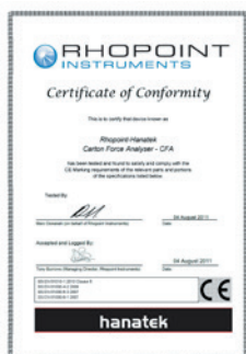
Certificate of conformity