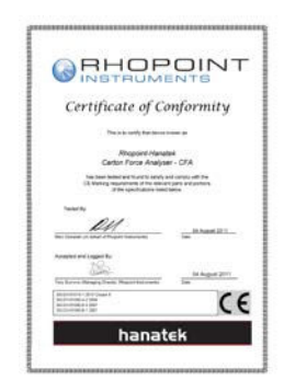
Certificate of conformity