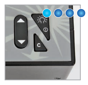
The 'READ' key to take a gloss measurement.

Press and HOLD the 'READ' key to take a continuous gloss measurement.