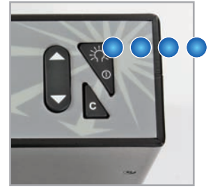
The 'READ' key.