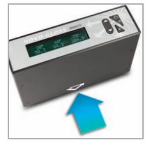
The measurement position is indicated by the arrow.

If the measured value does not match the assigned value, follow the calibration procedure (see page 6).