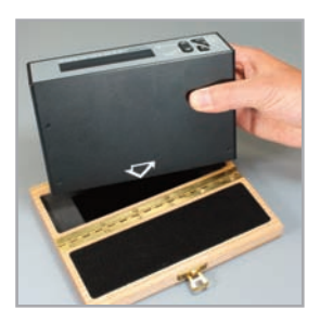
Place the instrument on the tile.