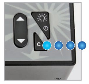
Press and HOLD the 'C' key to start calibration.