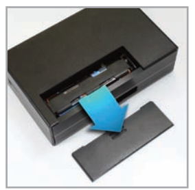
To access the batteries slide the compartment panel downwards.

Set Calibration value – In Set Calibration Mode press the UP/DOWN keys to adjust the calibration value.