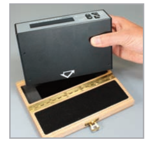
Place the instrument on the tile.