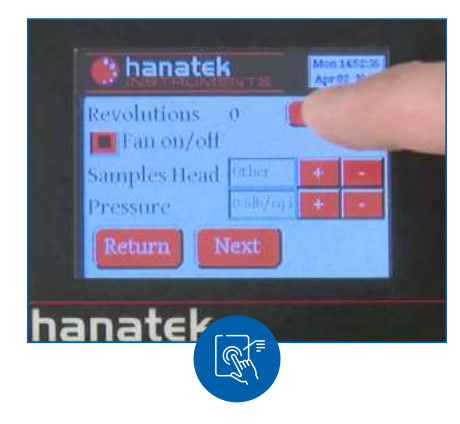
Touch screen operation ensures quick configuration of test parameters