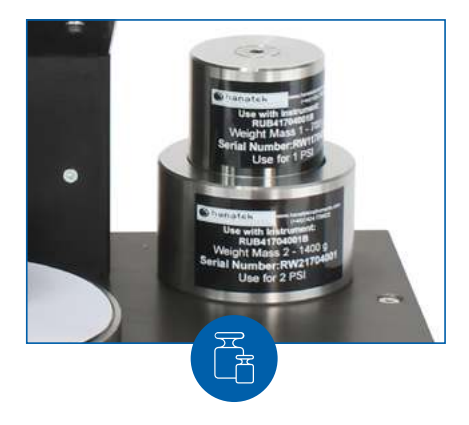
Choice of weights to comply with BS3110 methods for measuring rub resistance of print