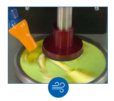
Air feed hose to remove fibres and debris which act as abrasive agents