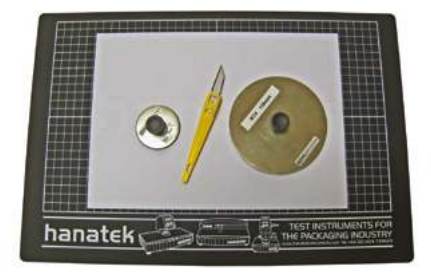
Sample template cutter for 50mm and 115mm ø included with instrument. Suitable for low volume testing.