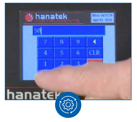
User-configurable cycle times allow tests be to run unsupervised